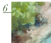
6 From the Overlook 11 x 9” September 2005 As seen from the Overlook Deck off Sackett Blvd., Cascade Valley South Metropark $180