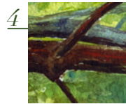
4 Entwined 7 x 11” July 2009 Painted off the Adam Run trail in Hampton Hills Metropark. Collection of MK