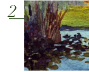
2 The Beaver Marsh 11 x 15” August 2008 Painted from the boardwalk that crosses the marsh next to the Cuyahoga River in the Cuyahoga National Park. $350