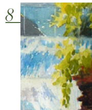
8 Coppacaw, the Big Falls 15 x 22” June 2008 This depiction of the Big Falls was painted from my photos superimposed on photos taken before the falls were destroyed by the 1913 Ohio Edison dam in Gorge Metropark (see back). $650