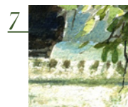
7 Power Grab 11 x 15” June 2008 My preliminary painting for Coppacaw, painted from the same vantage point in the Gorge Metropark. $450