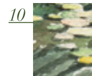
10 Reflections 11 x 15” July 2006 Painted in Towner’s Woods Collection of ES