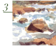
3 Yellow Creek Revisited 5 x 4” July 2005 Painted from the same spot I had painted while in college, off the Deer Run trail in O’Neil Woods Metropark. Collection of the artist