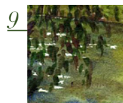
9 Newly Free 11 x 15” August 2009 Painted under the Rt 59 bridge in Franklin Mills Riveredge Park in Kent. $250